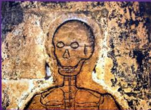
A Congregationalist's Journey

http://www.photosbybarryszymanski.com/book