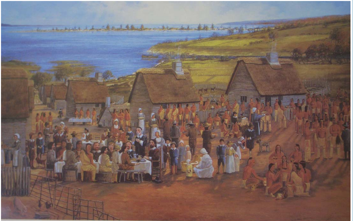
THE FIRST THANKSGIVING, 1621

In 1996 -1997 the painting was exhibited in a major exhibition entitled “The Art of Thanksgiving” at Pilgrim Hall Museum , Plymouth, Massachusetts. The painting has been featured in Scholastic Book Teaching American History with Art Masterpieces and on the Travel Channel as well as other school settings.